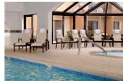
Indoor pool and hot tub at the hotel